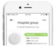
Minze app for clinicians