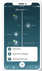
Uroflowmetry with bladder diary